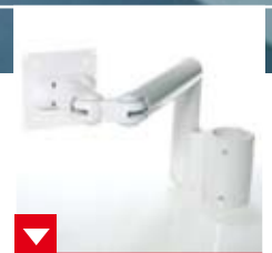
Different installation solutions