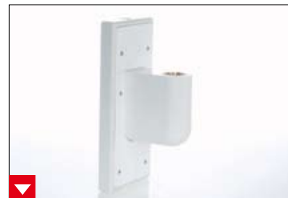
Wall mounting plate