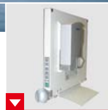
Easy adaptation of the handpiece holder and base unit