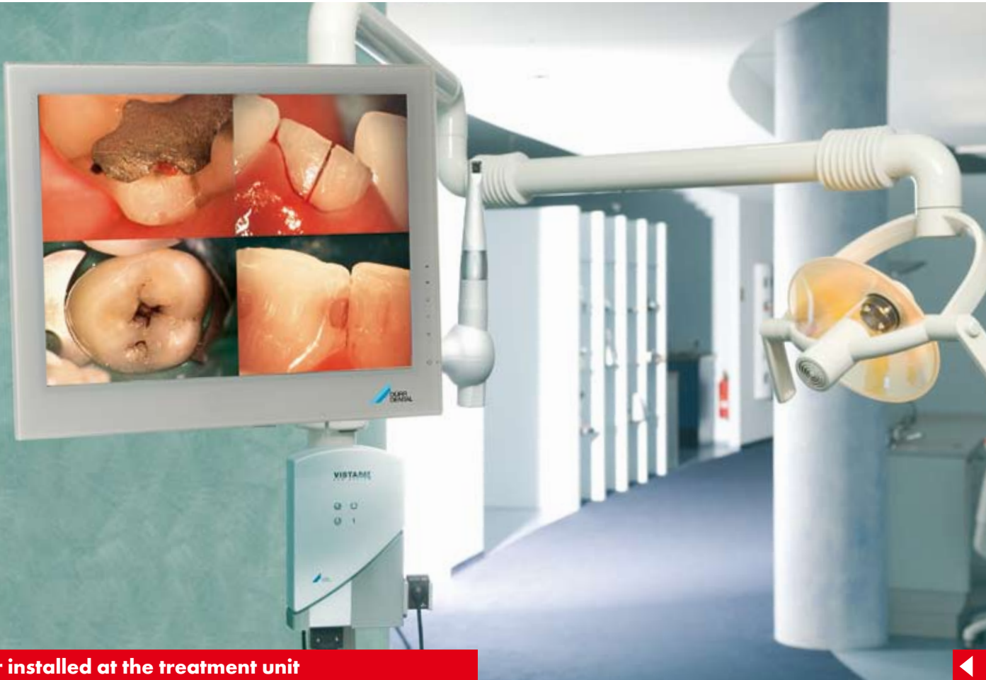
TFT monitor installed at the treatment unit

FLAT SCREEN AND ACCESSORIES FROM DÜRR DENTAL